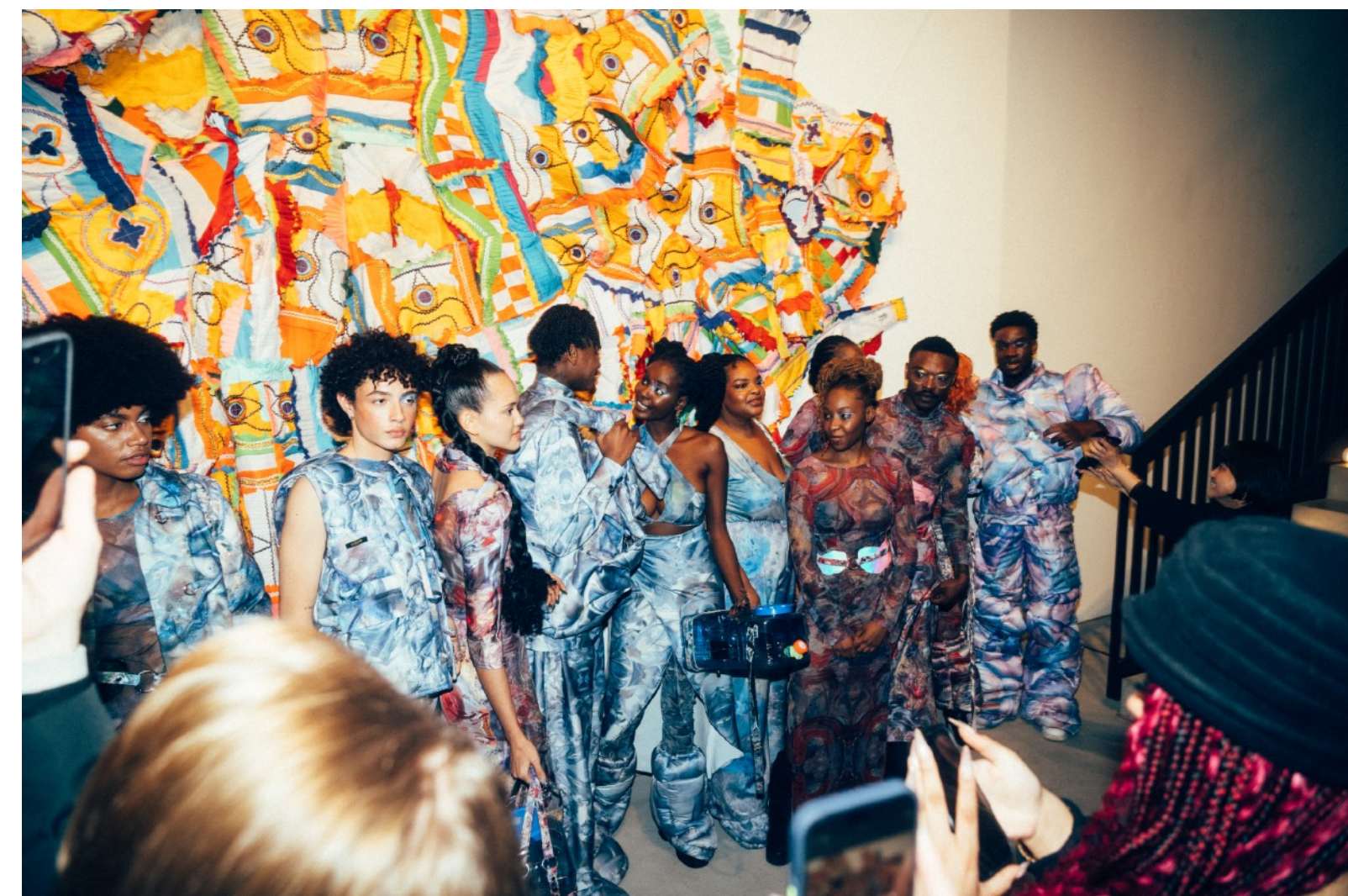
Nubuke foundation, Accra (Ghana) December 2023