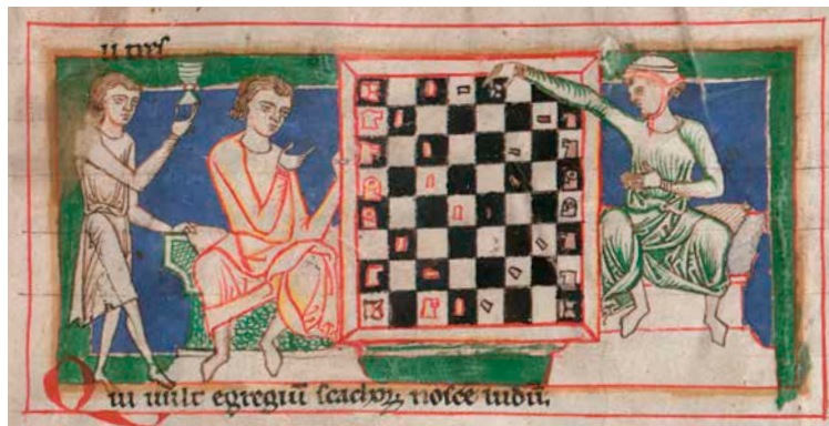
Fig.: München, Bayerische Staatsbibliothek, Clm 4660, fol. 92