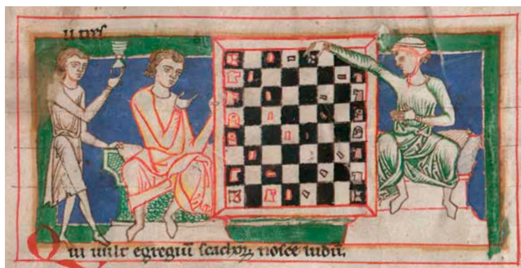
Fig.: München, Bayerische Staatsbibliothek, Clm 4660, fol. 92