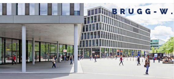
BRUGG - W.