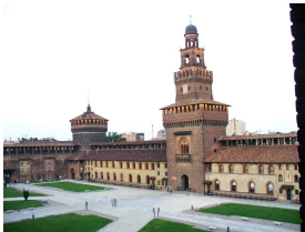
Castello Sforzesco, Milano

15.30-17.00 Tour to Museo degli Strumenti Musicali, Castello Sforzesco, Milano